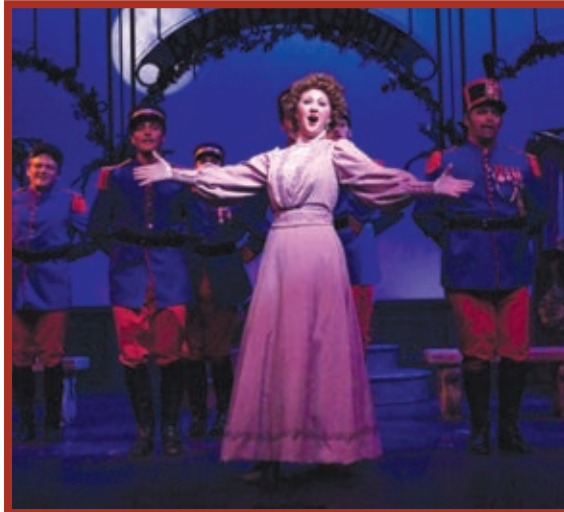
Mlle. Modiste, 2009