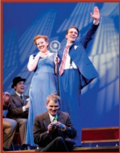
Of Thee I Sing, 2009