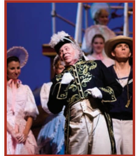
H.M.S. Pinafore, 2009

F rom its humble beginning, The Ohio Light Opera has grown to an internationally recognized lyric theatre company for its commitment to operetta as a viable, enjoyable and educational art form. The Ohio Light Opera is a ten-week professional residency company located on The College of Wooster campus in Wooster, Ohio. For more information, see our web site, www.ohiolightopera.org